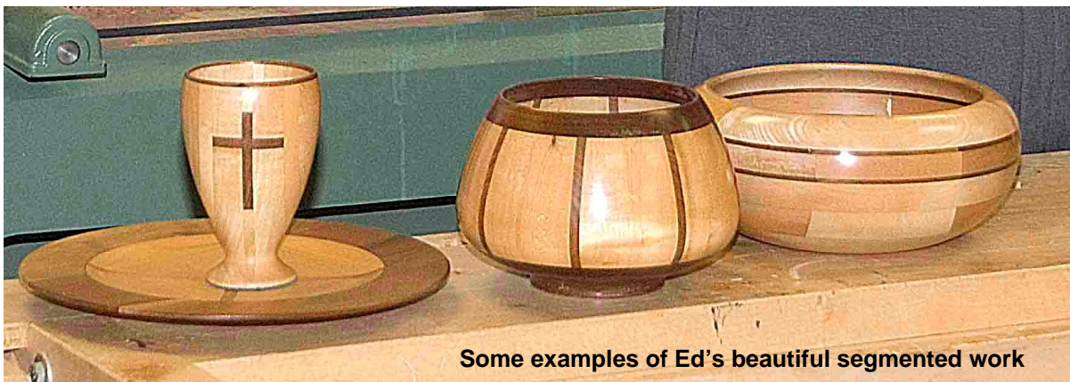
Some examples of Ed's beautiful segmented work

Ed stressed that all of these methods require one thing. All glue joints must be tight, otherwise there will be unsightly gaps in the final turned piece. To avoid these, boards must be planed smooth and flat. Warped boards, even if they can be forced into place with clamps, are to be avoided, Ed warned.