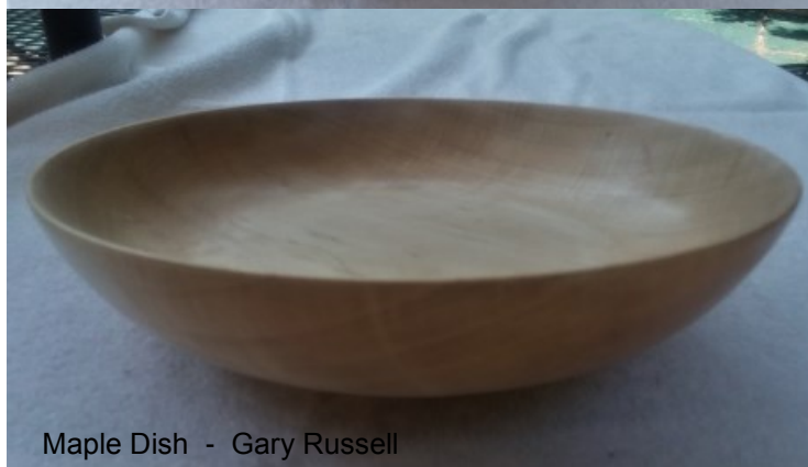
Maple Dish - Gary Russell