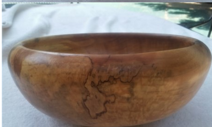
Spalted Maple - Gary Russell