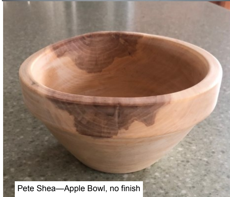
Pete Shea—Apple Bowl, no finish