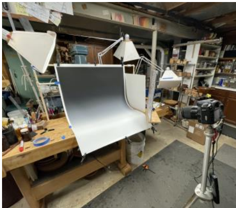
David's Photo Setup

Editors Note: Photo Credit—David Gilbert