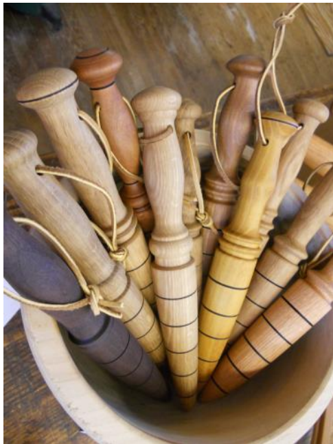
Dibbles are a great spindle turning project, and useful, too, for gardening

The Turning class is for all levels. Beginners start with a spindle turned dibble, and proceed to a green wood bowl. More advanced turners work on platters, hollow forms, and go into questions of technique and design. For more information http://www.folkartguild.org/craft-weekend/