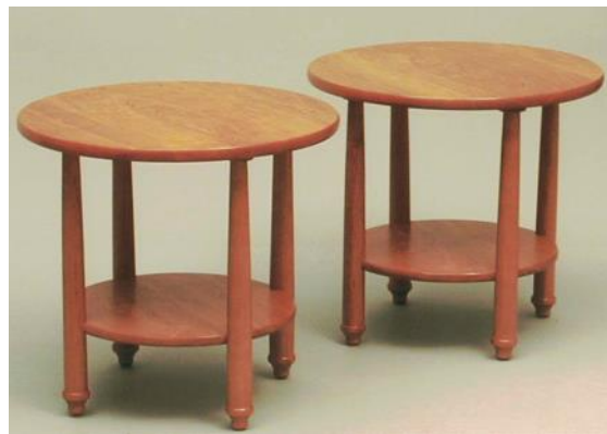
Cherry end tables that are totally turned