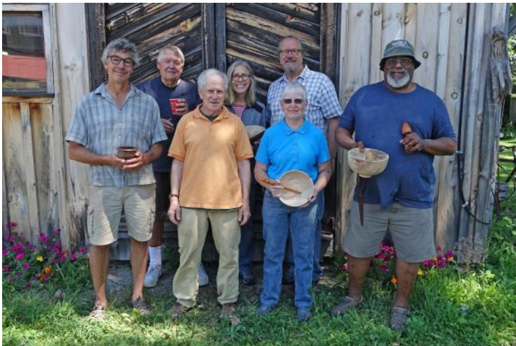
Craft Weekend Students