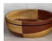
Modified Bowls Using Wave Sled