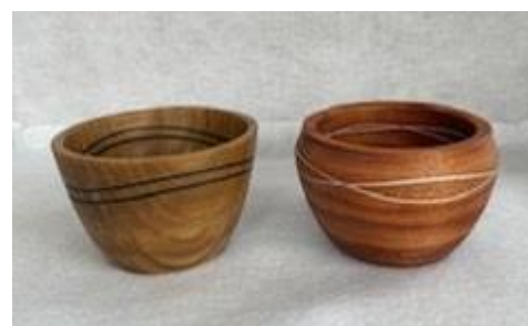
Double Wave Bowls