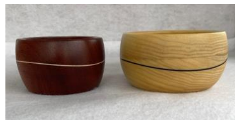
Single Wave Bowls