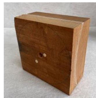
Bowl Blank - Single Wave