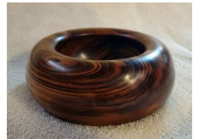
Bruce Bruni - Walnut Vessel