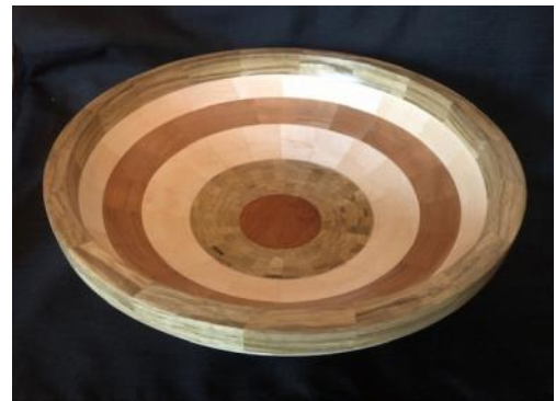
15 " bowl black limba rim, maple, cherry, maple, blakk limba with mahogany center