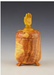
Honey Locust Pot Approximately 8 inches Tall the hand is osage orange.