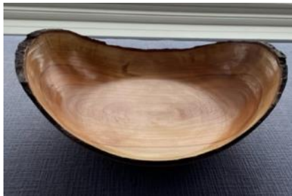
Natural Edge Cherry