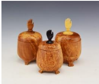
Bigleafs Waving Each are approximately 4 inch diameter All Boxes are Bigleaf Maple burl from Mr. Gould Hands are pear, ebony, and maple