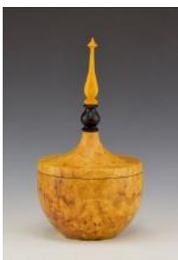
Locust Burl Box Approximately 7 inch diameter “Conventional” Finial is ebony and osage

The feet in the boxes above started as a ring turned below the box, then the extra between the feet was removed with a burr in a Rotozip.