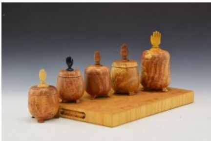
5 Hands on Board Includes 4 Hand Boxes above Fifth box in Spalted Beech with Pearwood Hand