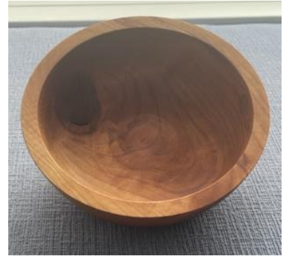
First Bowl Turned by Pete's 13 year old Granddaughter