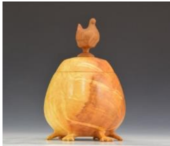
Chicken on the Pot Approximately 5 inch Diameter Burl is Box Elder Chicken is Pearwood