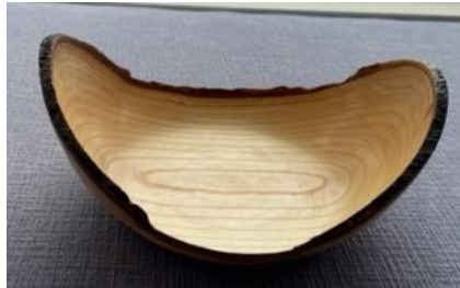
Natural Edge Ash

These turning are Appreciation Gifts that I put into a drawing for all my contributors for the American Diabetes Association-Tour de Cure Fundraiser.